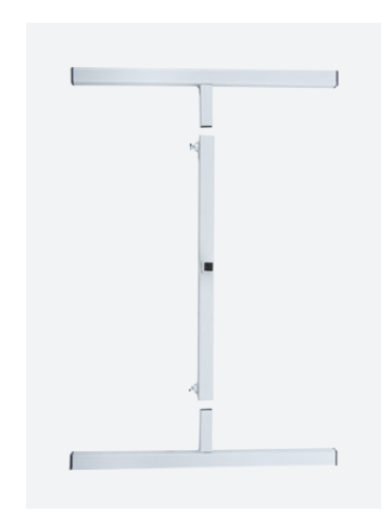
The first component relates to the base made from 30x30mm profile provided with snap-on caps.