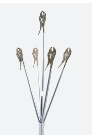
The third component relates to handles namely steel tubes provided with clamps used to attach car body parts purposed for painting. (APP No. 170226)