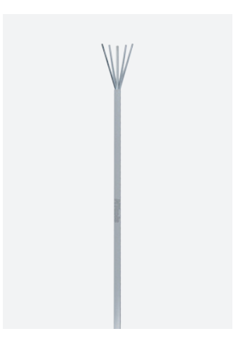
The second component relates to vertical one (profile: 25x25mm) finished with steel bars to which handles can be attached.