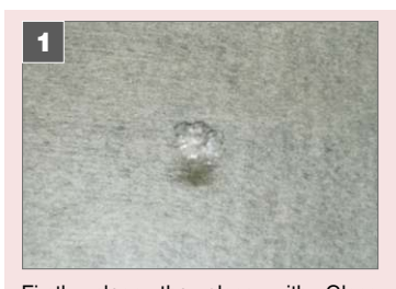
Firstly clean the glass with Glass Cleaner and microfiber cloth. Remove any moisture. The surface shall be dry, clean and free of any loose particles.