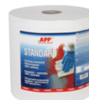
APP Standard CT Double layer industrial wipers APP No. 220624