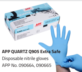
APP QUARTZ Q905 Extra Safe Disposable nitrile gloves APP No. 090664, 090665